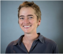
Some of the CAPRISA-affiliated researchers who gathered in Madrid, Spain to share research findings on bnAbs and HIV prevention studies

C APRISA collaborators and researchers participated in several sessions at the 2018 HIVR4P conference held in Madrid, Spain from 21 – 25 October where the latest biomedical prevention research was presented. The presentations by CAPRISA focused largely on broadly neutralizing antibodies and vaccine research. One of the highlights at the conference was understanding how to tweak the broadly neutralizing antibody structural characteristics itself to better preserve function and half-life for translational passive immunization studies in humans to prevent HIV.